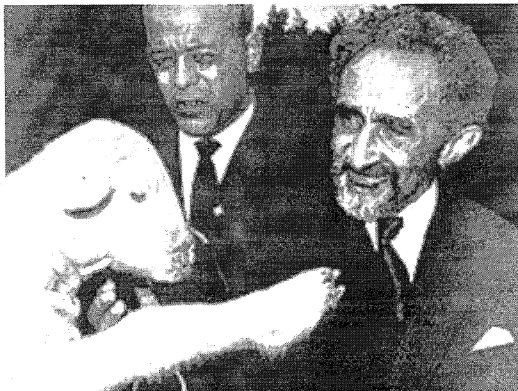
His Imperial Majesty with A Beloved LAMB!