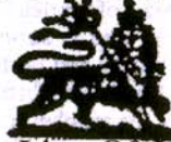
The Lion Of Judah