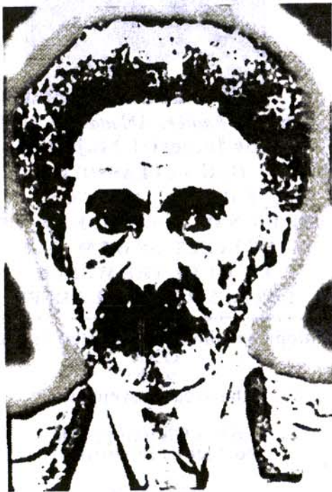
H.I.M. HAILE SELASSIE I

REVELATIONS CHAPTER 6 VERSE 17 "FOR THE GREAT DAY OF HIS WRATH IS COME; AND WHO SHALL BE ABLE TO STAND ?"