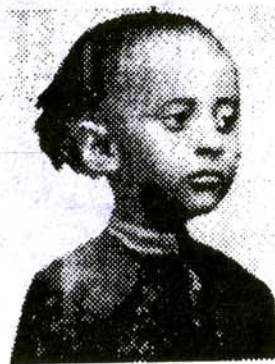
This Is H.I.M., LIJ TAFARI.

In 1892 A.D., on July 23rd in the month of the solar Lion "Leo", prophecy was fulfilled of a man-child who was born to rule the nations (refer to Isaiah Chapter 9 Verse 7). This child, LIJ TAFARI, was a direct descendant of the Queen of Sheba and King Solomon's first born son named "Ebna Hakim" (Son of the Wise) who was later to be known as Menelik. Yet, it wasn't until 1930 A.D. for "ALL EYES TO BEHOLD HIM!!" Many couldn't believe it at first. We saw H.I.M., Our eyes beheld H.I.M., His Imperial Majesty, the "King in his beauty" (refer to front cover) and the "Land that is very far off (Ethiopia)". Refer to Isaiah 33:17. And it is written, "... a child shall lead them." Ameyn.