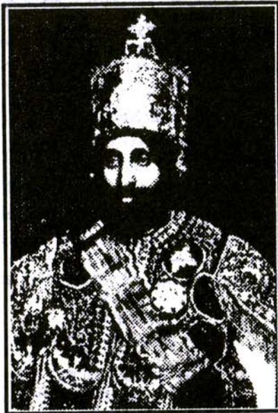
H.I.M. HAILE SELASSIE I

"LOOK TO AFRICA FOR THE CROWNING OF A BLACK KING HE SHALL BE THE REDEEMER!" - the Words of the Hon. Marcus "Mosiah" Garvey (1927 a.d.)