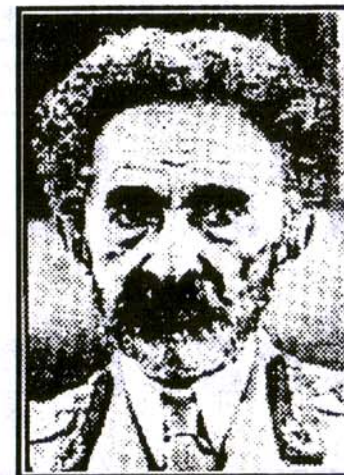
His Imperial Majesty HAILE SELASSIE I THE KING OF KINGS THE LION OF THE TRIBE OF JUDA THE ELECT OF 'GOD' LIGHT OF THE WORLD EARTH'S RIGHTFUL RULER

All Ethiopians who are interested in becoming ONE with the great movemant of Jah's Chosen people contact us in writing :