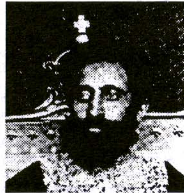
THE LAMB H.I.M. HAILE SELASSIE I, KING OF KINGS OF ETHIOPIA, THE CONQUERING LION OF THE TRIBE OF JUDAH.

"AND HE SAID UNTO ABRAM, KNOW OF A SURETY THAT THY SEED (CHILDREN) SHALL BE A STRANGER IN A LAND